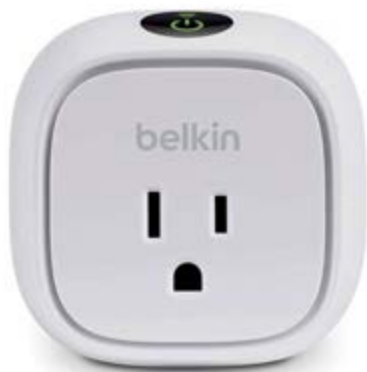
Figure 3. The Belkin WeMo Insight Switch allows you to turn devices on or off, program customized notifications, and change device status—from anywhere.

Well, Belkin has a simple, practical solution that takes care of most of my interests. For only $10 extra, Belkin has literally added “insight” to their basic WeMo Switch. Their WeMo Insight Switch ( Figure 3 ) has a miniature utility meter inside its new package that is even smaller than the previous generation. Wahoo! Wouldn't most technology enthusiasts go wild over a $10 utility meter that sits inside a Wi-Fi node in a switch that is about the size of a deck of playing cards? This thing is brilliant. The user interface ( Figure 4 ) is intuitive and sparked a lot of family discussion because it is as easy to understand and control for my 10-year-old daughter as it is for my mother.