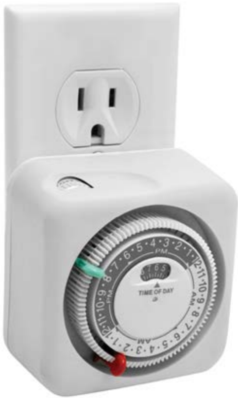
Figure 2. The Belkin WeMo Switch wall unit. Provides wireless control of TVs, lamps, stereos, heaters, fans, and more.

As a platform for building a home network, I don't need to pay for any installation assistance and it is fully modular. Its intuitive, easy setup lets me add one WeMo switch at a time, as budget allows, by connecting to my existing Wi-Fi router. I can put any device plugged into the switch on a schedule that I can modify as often as I'd like. I use my mobile device to set rules for notifying me and rules for the timer on/off cycles. The WeMo Switch acts like the mechanical timer when the Internet is not available.