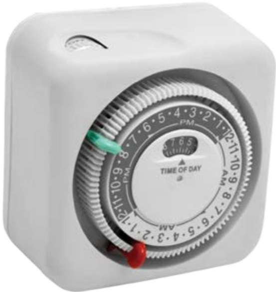
Figure 1. Typical mechanical timer.

Belkin offers their WeMo ® Switch wall unit ( Figure 2 ) as the modern way to introduce variability in turn-on/off times, especially when combined with their motion sensor. Belkin's WeMo Switch and its companion app uses my home's Wi-Fi ® network to give me control from my smartphone, tablet, or computer of choice. Initially, it struck me as a bit pricey at $49.99, but let's think about this again.