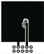
a. 78 °C/W when mounted on a 1 in 2 pad of 2 oz copper

1. R_{\theta JA} is the sum of the junction-to-case and case-to-ambient thermal resistance where the case thermal reference is defined as the solder mounting surface of the drain pins. R_{\theta JC} is guaranteed by design while R_{\theta CA} is determined by the user's board design.