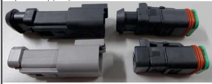
DT 3pin Weld Cap (After)